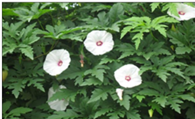
Fig 1: Merremia dissecta (Jacq.) Hallier