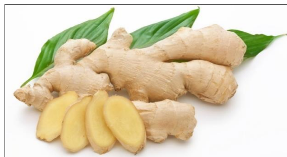
Fig 4: Zingiber