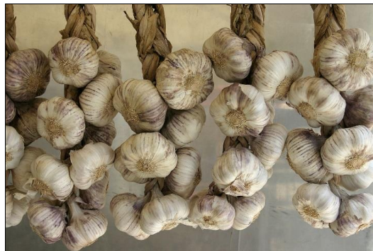
Fig 3: Allium sativum