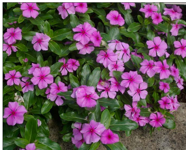
Fig 1: Catharanthus roseus