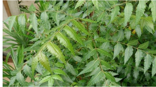
Fig 6: Azadirecta Indica