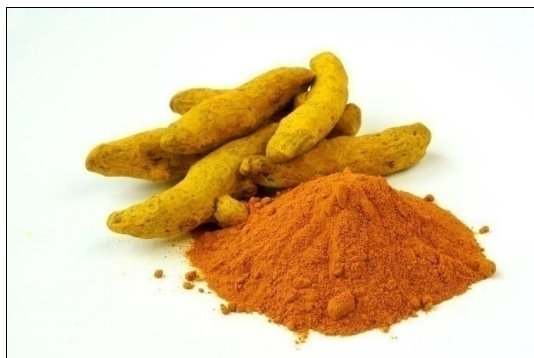
Fig 2: Curcumin