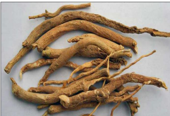
Fig 5: Whithania Somnifera