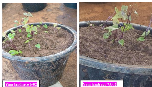
Fig 4: Acclimatized plantlets of two yam landraces after 45 days in greenhouse

survival rate at ex vitro condition and this finding was similar with finding of Obsi et al. , (2015) [42]. And almost similar survival rate (80%) was obtained by Kadota and Niimi, (2003) when micro-propagated plants of D. japonica were transferred to pots containing (1:1) vermiculite and soil (v/v) mixture under greenhouse.