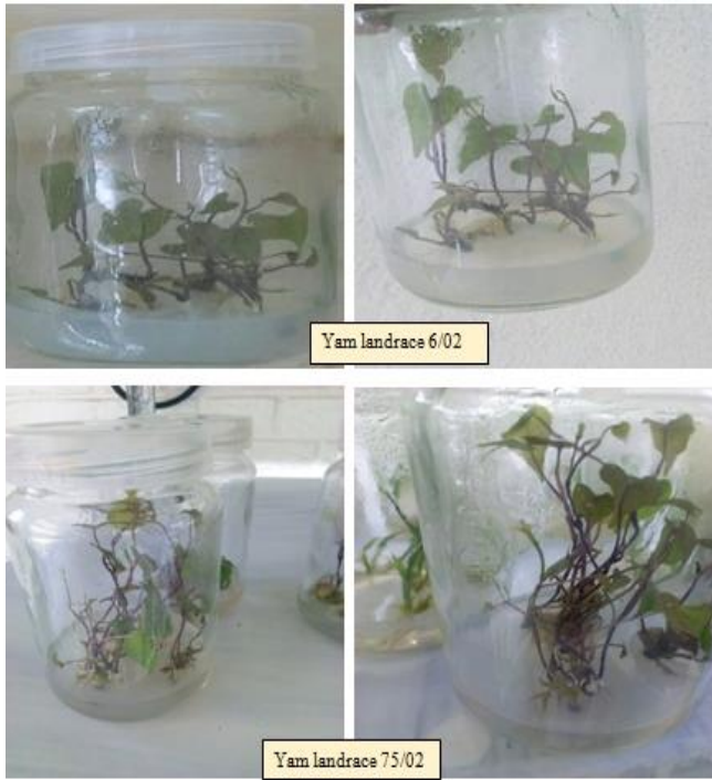
Fig 1: In vivo shoot multiplication for both 75/02 and 6/02 yam landraces on MS and after 45 days of culture